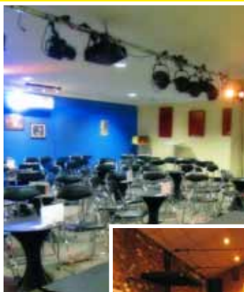
Sue Campbell Room

Sam is an out of work actor who answers the reservations line at Manhattan's number one restaurant. A cast of desperate callers will stop at nothing - coercion, threats, bribes - to land a prime reservation. But Sam has a sure-fire audition at the Lincoln Centre and a widowed dad who wants to see his kid home for Christmas. While juggling scheming socialites, name-dropping wannabes, fickle celebrities and egomaniacal bosses, can Sam last through this one hectic day? A rapid, boisterous, tour de force of a comedy with a massive heart.